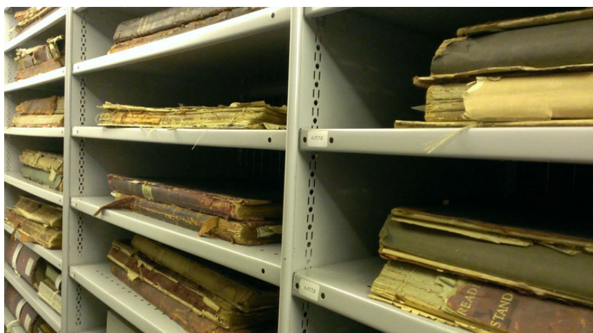
Just a few of our new - and rather battered - newspapers

Three other new collections have such substantial preservation needs that they are unlikely to become available quickly. A treasure trove of sale catalogues and other property records was retrieved from Dreweatt Neate, the Newbury land agents, while both the Reading Post and Chronicle transferred their vast archive sets of Berkshire newspapers. The latter include complete runs of the Reading Standard from 1873, and the Reading Mercury from 1773; even though the British Library has made their copies available online, we felt that we ought to take what are the 'official' copies of such key local assets. They include a very rare set of the short-lived Maidenhead Argus .