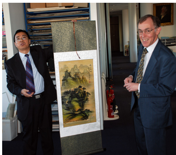
A gift from Chongqing

We were also delighted to host a group of staff from Chongqing Municipal Archives in China. The visit culminated in the exchange of gifts - a bamboo artwork in a presentation box for us, and a copy of the Historical Atlas for Berkshire for them; both sides seemed equally delighted with their bounty.