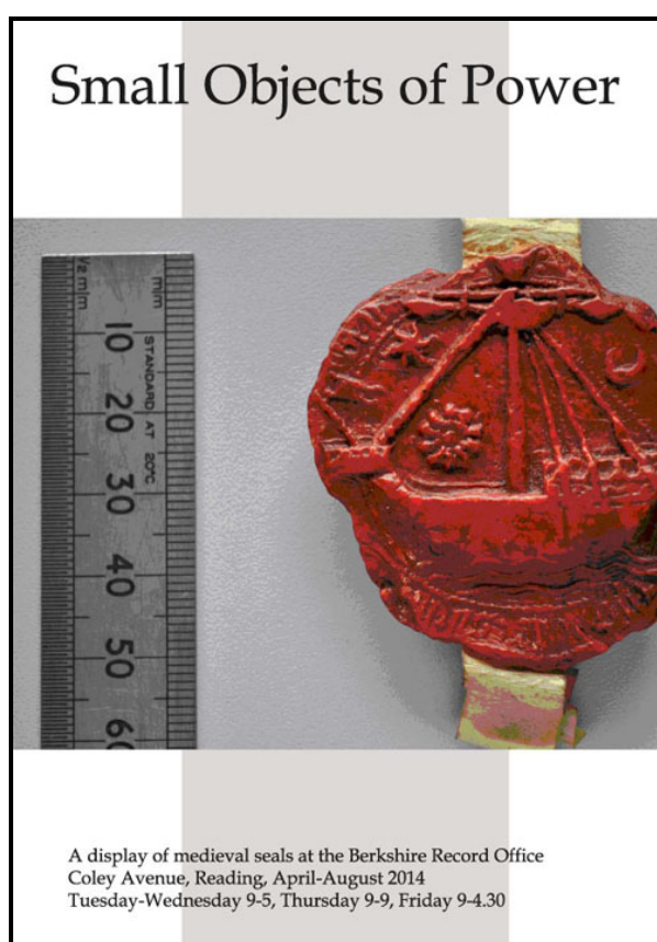
Poster advertising our seals exhibition