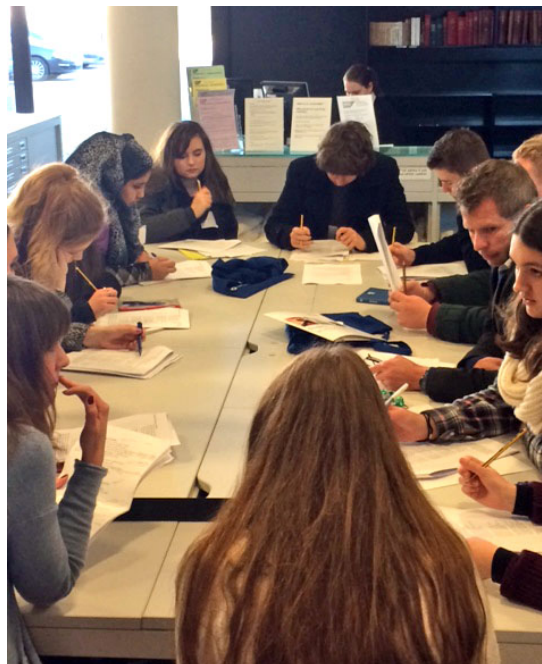
A level students get to grips with a Victorian pub quiz

The year saw an expansion of our work to support students at the University of Reading. In addition to the now regular sessions for history undergraduates, and early modern literature postgraduates, we hosted two learning events as part of the 'Oscar Wilde and Reading Gaol' project - one for Victorian literature students, and another for A level students interested in studying English at university.