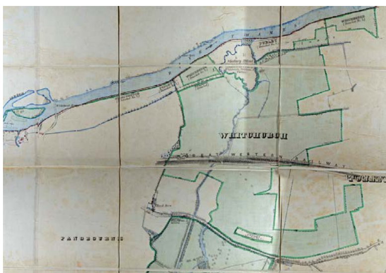
Part of the Whitchurch boundary map bought at auction

We also dipped into our documents purchase fund to purchase a small number of items that came up at auction. We are hugely grateful to our customers, who continue to drop notes and coins into the donations box. This year, their generosity allowed us to purchase two private patient case books from Fair Mile Hospital (books that should never have left public ownership in the first place); an order made at the Berkshire Quarter Sessions regarding the county boundary at Whitchurch in 1875; and a copy of the Garford enclosure award from 1827.