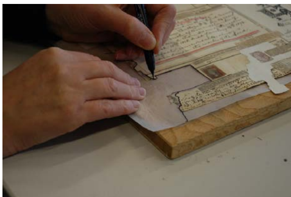
Recreating the gaps in the Farnborough scrapbook

The whole volume was disbound and then each page treated separately. Missing areas were recreated with plain watercolour paper, attached with wheat starch, while fragile items on each page were reinforced with archival heat-set tissue. Each page was then guarded with watercolour paper and re sewn onto tapes, before the boards were reattached. A new, cloth spine was glued under the original leather, and a new cloth cover attached to the boards, leaving the original cloth label visible on the front.