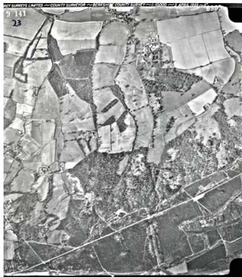
Part of Bucklebury, seen from the air in 1969

In terms of bulk, the largest two were both local authority collections. Firstly, as a team, the staff listed all the aerial photographs we inherited from the old County Council. These were taken every few years between 1964 and 1996, and (with some losses) provide an almost complete bird's eye view of the county during a period of much change. In contrasting method, one member of staff worked alone to list the 2,000 building control plans deposited with Easthampstead Rural District Council from 1908 onwards - a rich architectural resource for what would become Bracknell New Town and its surrounding villages.