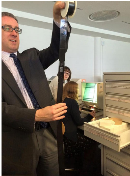
The County Archivist introduces Discovering Archives students to an ancient technology

We also worked with the University's History Department to create a new study module for undergraduates - 'Discovering Archives and Collections', and took our first students in the January term. The aim of the module is to give students an opportunity to understand how and why historical sources come to be kept, and the philosophy behind their management. Feedback has been very positive, and it is planned to run the module again in the autumn term.