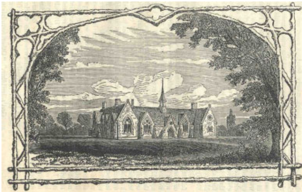
Engraving of the new Piggott schools from the cover of a Wargrave Parish Magazine, June 1862 (reference D/P145/28A/1).

When Wargrave deposited some parish records in October 2004, the Record Office was delighted to discover that among them was a set of parish magazines, which were both the earliest and the most complete in all its parish collections. Dating from 1861 and continuing to 2002 they provide a fascinating picture of life in Wargrave over nearly 150 years.