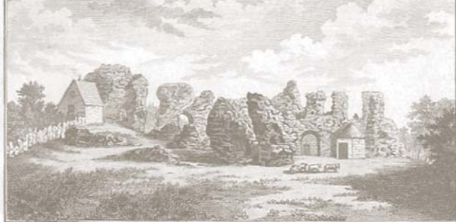
READING ABBEY, in BERKSHIRE. Plate 2.

Published according to the instructions of Her Majesty's Stationery Office.